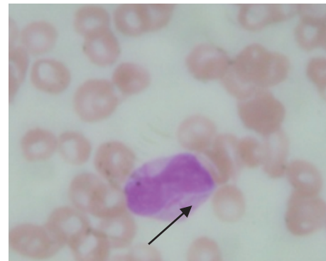
Fig. 3: Blast with Bilobed Nucleus and Auer Road (Arrow)

In this case given the analytical data, the morphological evaluation of peripheral blood smear is mandatory. The leukocytes differential count obtained with light microscopy showed neutropenia (Neutrophils = 0.81 \times 10^9/L ), moreover the blood smear showed several blasts with small and stubby cytoplasmic Auer roads, nucleus often atypical appearance or Internuclear bridge (Fig. 3 & 4).