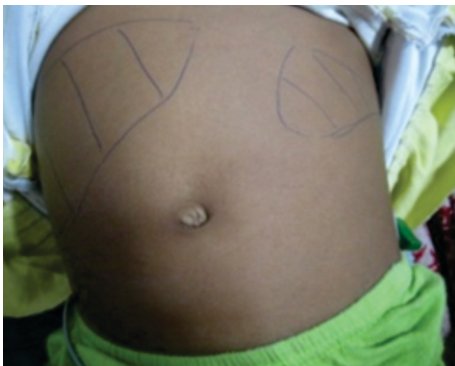
Fig. 2: Hepatosplenomegaly

The heart rate was 133/min, O 2 saturation 98% with massive hepatosplenomegaly (Fig. 2) and lymphadenopathy. The complete blood count showed severe normochromic anemia (Hb = 5.4g/dl, Ht = 21%; MCHC = 27g/dl) and severe thrombocytopenia (PLT = 0.30 lakhs/ \mu l). There was leukocytosis (WBC = 127.9 \times 10^9/L ) and the automatic differential leukocyte count showed neutrophilia (Neutrophils = 70%)