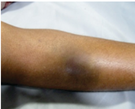
Fig. 1: Petechiae Over Limbs